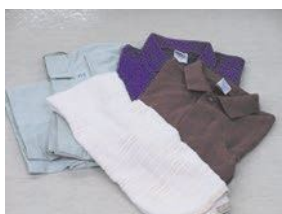
Clothing such as shirts and cloth such as towels