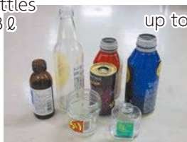
Glass bottles and cans for beverages, food, and medicine Cosmetic bottles