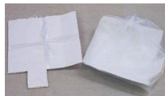
Paper beverage cartons for milk or juice, etc. that are white inside