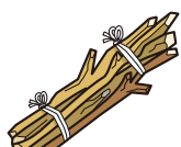
Trimmed branches, etc.

Put in a clear or semi-transparent plastic bag.