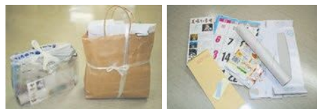
Magazines & publications