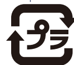
This is the symbol!