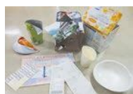
Non-recyclable paper (Waterproof paper, thermal paper, etc.)