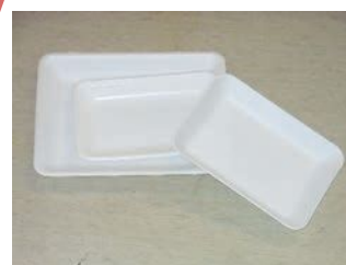
White food trays with no design or color used for meat, fish, prepared food, etc.