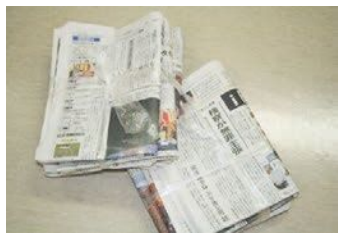
Newspaper (Including ads)